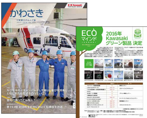
Figure 23: Articles featured in internal bulletins

We are engaged in public relations activities aimed at enhancing the perception and awareness of environmental issues among each and every employee of the Group. We conduct ongoing awareness raising activities including the publication of environment-related articles in the Kawasaki internal bulletin, distribution of the President's message for Environment Month, and distribution of information (environmental data, case examples of energy saving, etc.) through our intranet, so that employees can put environmentally conscious activities into practice not only at the workplace, but also in local communities and homes.