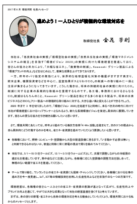
Figure 24: President's message on environmental management