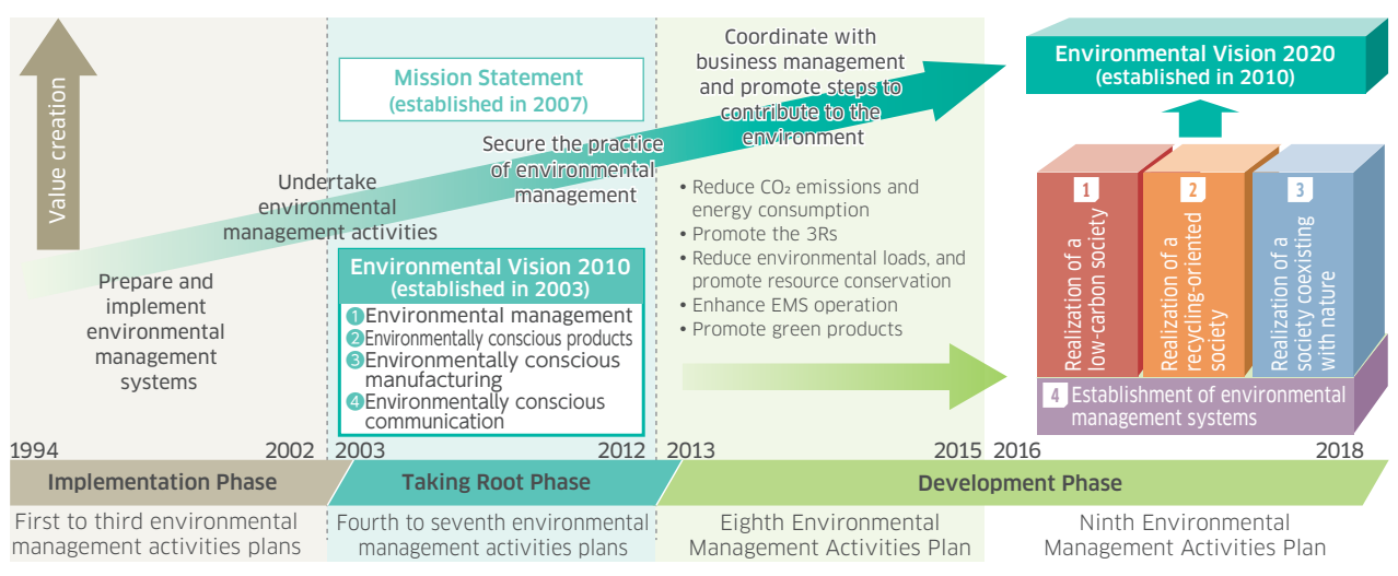
Figure 3: Environmental Management Flow