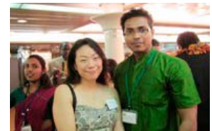
Communicating with youth program participants