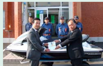
The Jet Ski is delivered.

On March 6, 2013, to support the recovery of the coastal fishing industry and help prepare for future emergencies, KHI donated a Jet Ski STX-15F to Matsushima Town in Miyagi Prefecture.