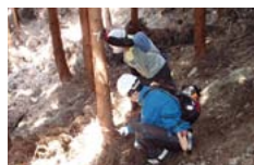
In Hyogo Prefecture, employees join in tree-thinning operations.

In Taka Town in Hyogo Prefecture, KHI has participated in the prefecture's corporate forest restoration project since 2008. Participants are recruited in house in the spring and fall. As of April 2013, a total of approximately 880