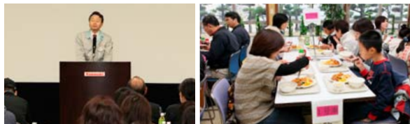
Akashi interaction group

At Kawasaki Good Times World, the children were asked what they would like to make, and one of the younger boys replied with a beaming smile: "A robot!"