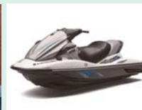
Jet Ski STX-15F