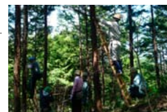
In Miyagi Prefecture, branch pruning operations are carried out jointly with nonprofit organizations.

By carrying out forest restoration activities at a number of locations in cooperation with local communities, we are contributing to coexistence between humans and nature.