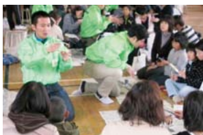
The children became so engrossed that they forgot to go and play during break!

Going forward, the KHI Group will continue to work with local communities to explore ways of making social contributions through its business operations.