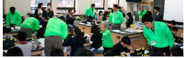
Children making their own cranes

As part of our program, which was designed to allow children to experience the wonder of science and technology and the fun of making things, children used two syringes of differing size to discover Pascal's principle, assembled a model of a crane, and practiced lifting heavy objects with small amounts of force. We hope that encounters with technology of this kind will inspire many children to decide "I want to be an engineer when I grow up."