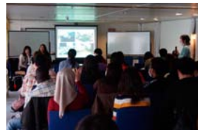
An on-board lecture

KHI staff members, consisting mainly of younger employees, joined the program participants in a visit to the corporate museum Kawasaki Good Times World. Afterward, the two sides attended a talk on the KHI Group's CSR and environmental activities and enjoyed a social meeting over lunch, promoting mutual understanding and friendship.