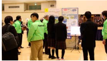
Students gathering at the KHI booth

KHI has exhibited at the annual event since its second year. This year, we used the "Make Your Own Crane!" program described above to explain the principle of hydraulic technology and present examples