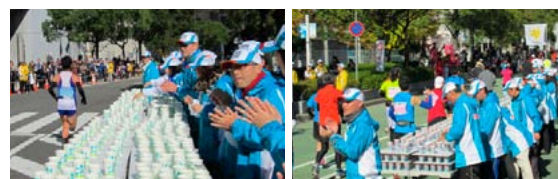
Volunteers at the water station

On November 25, 2012, we followed up on our participation of 2011 by contributing to the Kobe Marathon as a race bib sponsor for male runners. In addition, 160 employee volunteers turned out to man the roadside water stations and cheer on the roughly 20,000 athletes as they raced through the streets of Kobe.