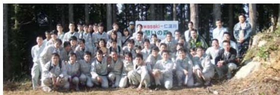
In Kochi Prefecture, new employees engage in forest maintenance activities.

To help bring about a society that coexists with nature, the KHI Group engages in activities to preserve the ecological environment in three locations: Kochi, Hyogo and Miyagi prefectures.