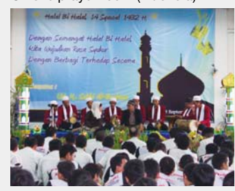
Halal Bi Halal