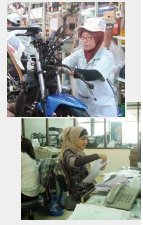
Women employees wearing a headscarf