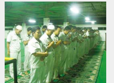
On site prayer room (mushola)

religions, culture and customs of the land and execute business activities that respect human rights.