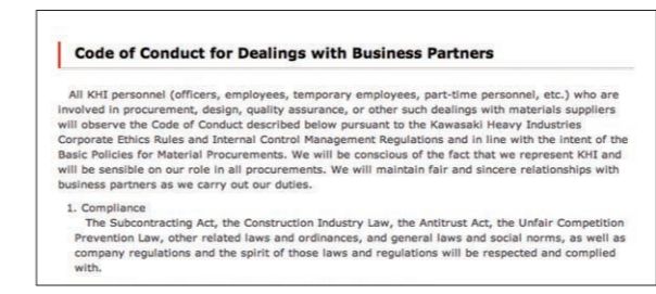
Code of Conduct for Dealings with Business Partners (excerpt)

In accordance with Basic Policies for Material Procurement, we undertake procurement activities predicated on long-standing relationships of trust with our business partners. Coinciding with the establishment of these policies, we partially revised our Code of Conduct for Dealings with Business Partners, and everyone—including employees in design and manufacturing departments—who deals with business partners strives to carry out his or her duties in line with these guidelines. We seek to ensure widespread acknowledgement of the guidelines and toward this end post them on our web site, with each division prominently displaying them as a constant reminder of the importance of fairness and mutual trust.