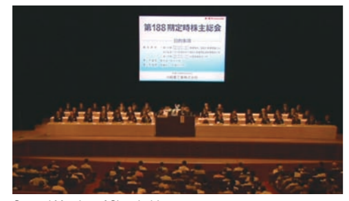
General Meeting of Shareholders

At KHI, we believe the General Meeting of Shareholders—the highest corporate decision-making body of any company—is an important opportunity for communication between the Board members and our shareholders. To enable shareholders to properly consider important matters on which they will cast their vote at the General Meeting of Shareholders, we send out the convocation notice even earlier than required by law. In addition, we prepare an English version of our official Japanese-language convocation notice for the convenience of our shareholders overseas. Shareholders who are unable to attend the annual meeting in person now have the option of exercising their voting rights through the Internet or by mobile phone. At the meeting venue, we endeavor to present information, highlighting new developments and business results over the past year, in an easy-to-understand format utilizing video. Presentation videos from past meetings are available for viewing on our web site.