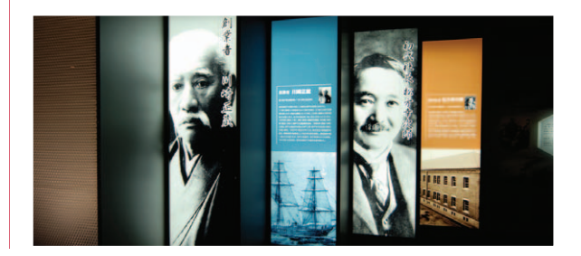
Exhibit at "Science Fair in Hyogo"

The Kawasaki Good Times World museum also holds various events and other programs as a part of our efforts to communicate with the local community as well as to foster the next generation.