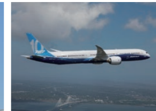
Boeing 787 Dreamliner Photo provided by Boeing Company