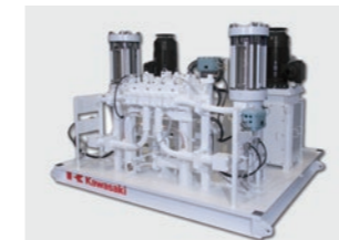
Hydraulic booster "Hydrogen compressor"