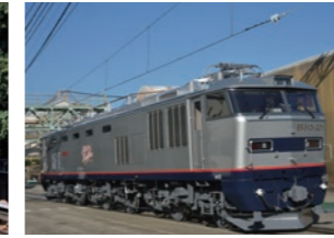
Japan Freight Railway Company Class EF510 300-series electric locomotives