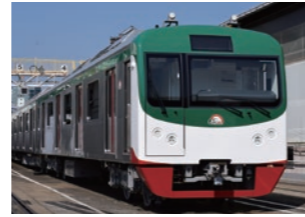
Dhaka MRT Line-6 cars for Dhaka Mass Transit Company Limited in Bangladesh