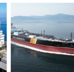
86,700 m³ LPG/ammonia carrier