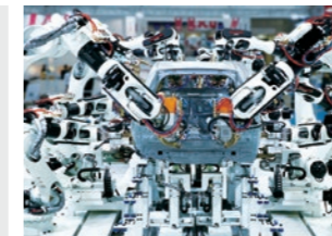
BX series spot welding robots for automobile body assembly lines