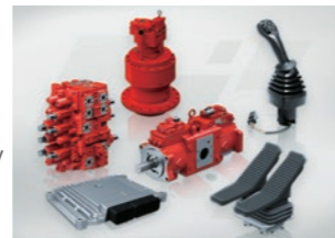
Hydraulic components for construction machinery