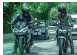
Ninja e-1 and Z e-1