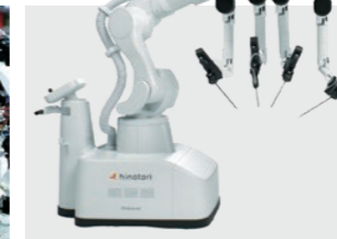
hinotori™ Surgical Robot System