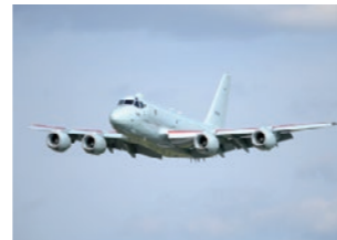
P-1 Maritime Patrol Aircraft