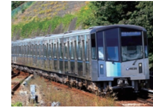
4000V-series subway cars for Yokohama City Transportation Bureau