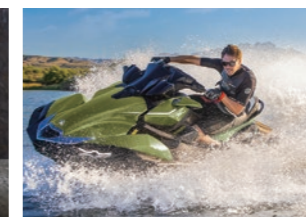
JET SKI® Ultra 310LX