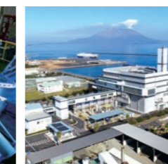
Municipal waste incineration/biogas facilities for Kagoshima City's Nanbu (south) waste processing plant