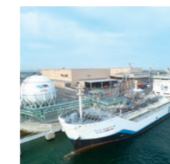
Liquefied hydrogen cargo handling demonstration terminal and SUISSO FRONTIER