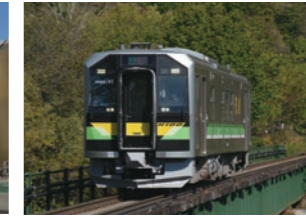
H100-series railway cars for Hokkaido Railway Company

Energy Solution & Marine Engineering 19.1%