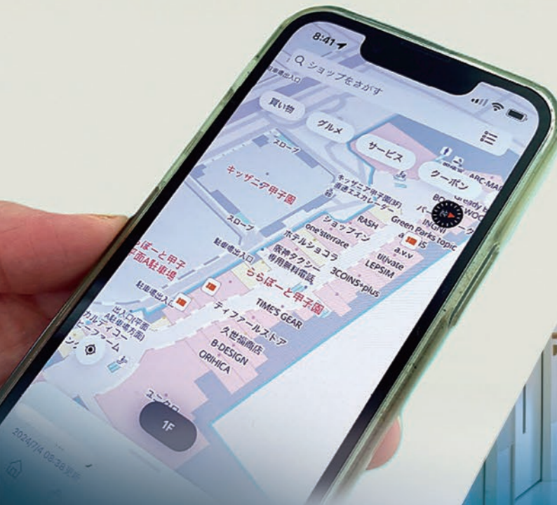
The mapxus Driven by Kawasaki™ indoor mapping service