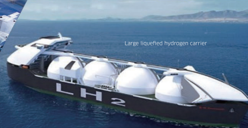
Large liquefied hydrogen carrier