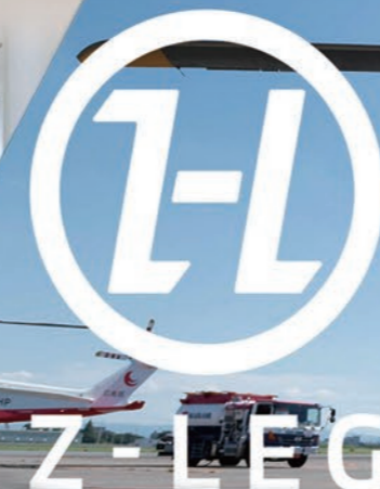
Z-Leg™ helicopter arrangement service