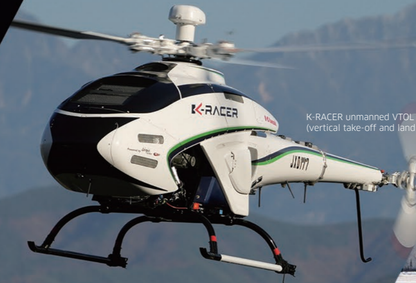
K-RACER unmanned VTOL (vertical take-off and landing) aircraft