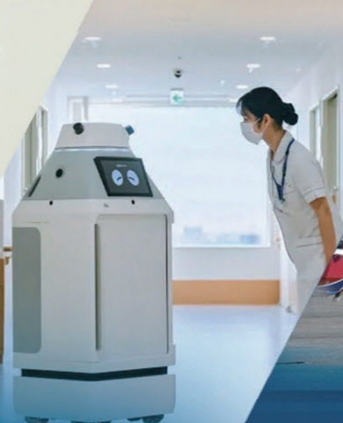
FORRO indoor delivery robot