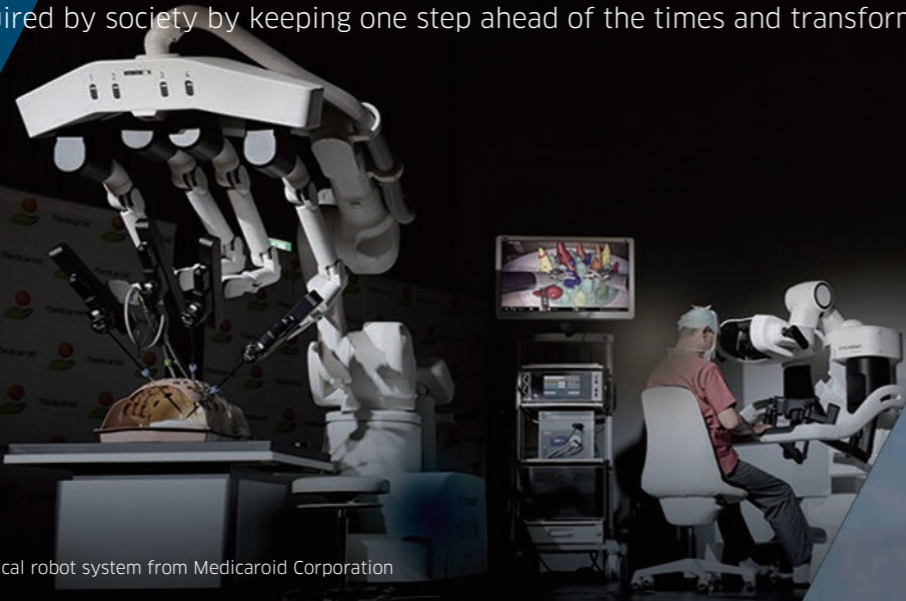
The hinotori™ surgical robot system from Medicaoid Corporation