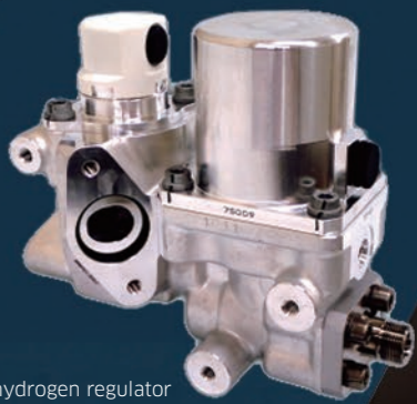
High-pressure hydrogen regulator

Utilizing the technology and knowledge nurtured since our founding, from now on also we will create new solutions required by society by keeping one step ahead of the times and transforming ourselves.