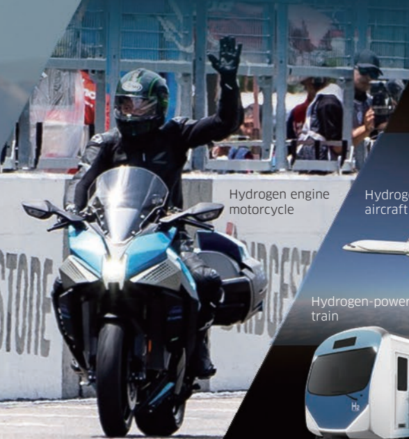
Hydrogen engine motorcycle