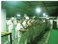
On site prayer room (mushola)

This demonstrates KMI efforts to accommodate the local religions, cultures, and customs of the land and execute business activities that respect human rights.