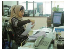
Female employees wearing headscarves