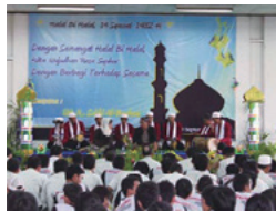
Halal Bi Halal