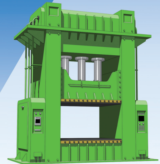
Application example: Press machine