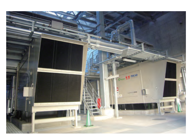
Fig. 1 Appearance of CHP unit

In this article, we report our contribution to the power supply of the "K" via the power supply protection system for the "K" and the energy-saving measure.