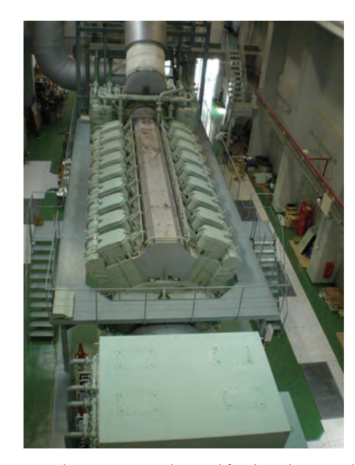
Fig. 6 Diesel generator set destined for the Okinawa Electric Power Company

These MAN-type engines and S.E.M.T. Pielstick PA6CL type 4-stroke engines, completed in 1993, are used in landbased power generation. We have a history of delivering utility-use generator sets for remote islands, emergency generator sets for nuclear power plants, and industrial generator sets, all of which have been given a favorable reception (Fig. 6).