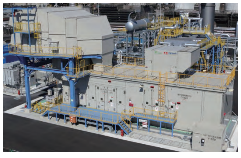
Fig. 3 30 MW class PUC300 cogeneration facility

In terms of after-sales services, we have built a remote monitoring system called "Technonet" using a gas turbine