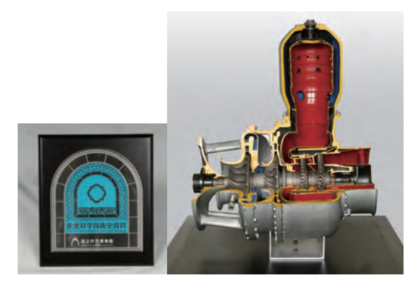
Fig. 2 Forerunner of gas turbines that became widely used as emergency generators (Essential Historical Materials for Science and Technology)

Since we entered the emergency power supply market in 1977, our gas turbine sales achieved a landmark as the 10,000th unit was delivered in February 2011. In September 2011, the 150 kW class S1A-01 gas turbine developed by us in 1975 was registered as the "forerunner of gas turbines that became widely used as emergency generators" and placed amongst the Essential Historical Materials for Science and Technology (Future Technology Heritage) at the National Museum of Nature and Science (Tokyo) (Fig. 2).