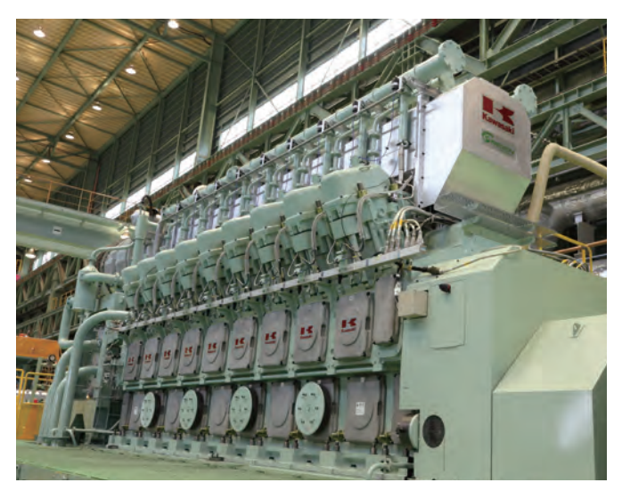
Fig. 7 7.8 MW Kawasaki green gas engine