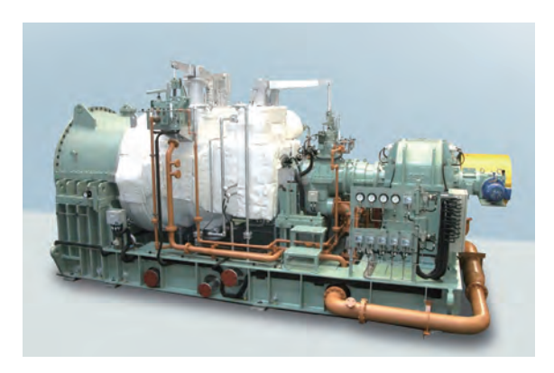
Fig. 8 Generator-use steam turbine

generation use, and HP and HC models for mechanical drive use (Fig. 8). Their output range extends from 1,000 kW to 150,000 kW.