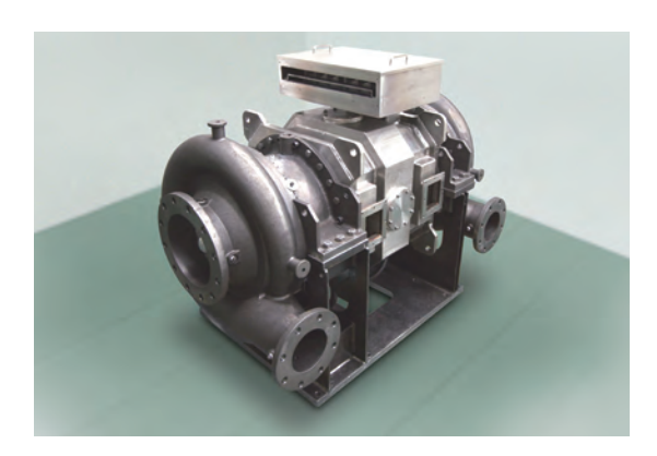
Fig. 9 Green binary turbine

Our top pressure recovery turbines do not adopt conventional governor valves to regulate blast furnace gas pressure, but variable stator blades by which the pressure is controlled by freely changing the angle of the inlet stator blades. For this reason, low-noise, high-efficiency power generation is allowed even under conditions in which the quantity and pressure of the gas passing through the turbine varies. As the top-ranking manufacturer of top pressure recovery generator sets, we have a track record of delivering about 50 units both in Japan and foreign countries, including the Republic of Korea, Taiwan, the Unites States, China and Brazil. In addition, inquiries for replacement projects in Japan are brisk.