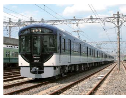
Series 3000 commuter train for Keihan Electric Railway Co., Ltd.

Operating income rose ¥5.9 billion, or 508.4%, to ¥7.1 billion, along with the rise in sales of this segment.