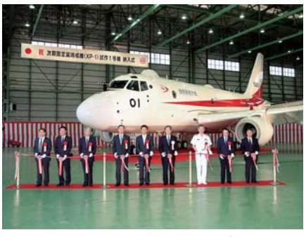
XP-1, the next maritime patrol aircraft

Operating income was down ¥10.1 billion, or 94.8%, to ¥0.6 billion, owing to the decline in sales and higher costs, including losses on revaluation of inventories.