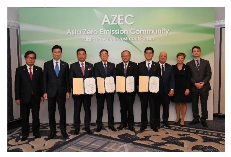
AZEC Public-Private Investment Forum

commercialization demonstration project under this Green Innovation Fund and to develop an international supply chain for liquefied hydrogen.