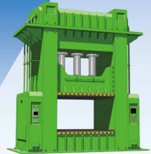
Application example: Press machine