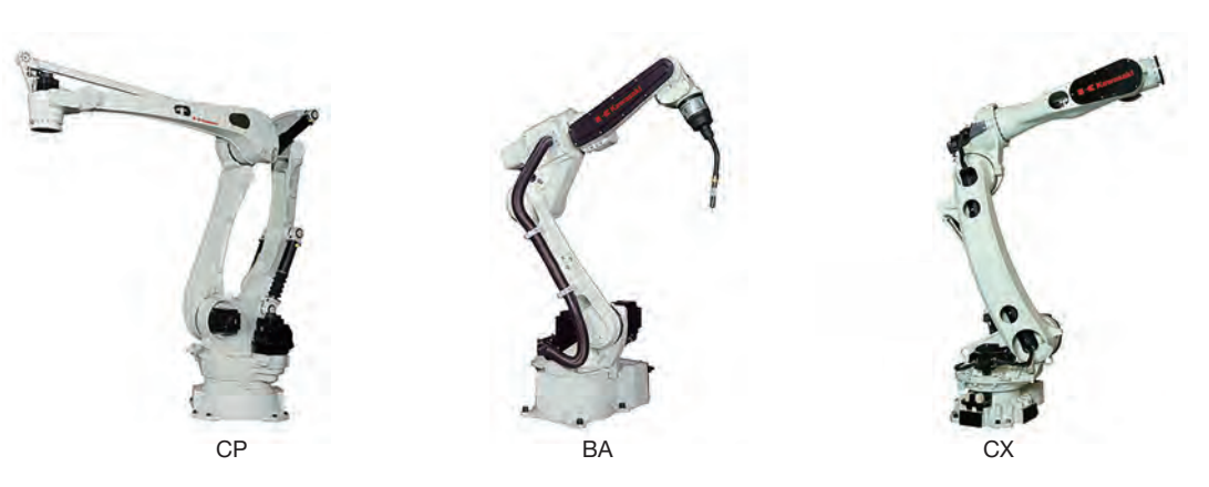
Fig. 2 China production model