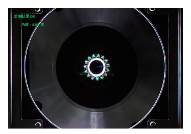
Fig. 5 Input gear measurement