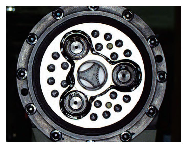
Fig. 6 Reduction gear sealant coating

In addition to incorporating a robot control shaft into the crane driving part, accurate transportation has been enabled by having the crane operate in collaboration with the robot arm. This system was introduced into processes that require accurate transportation of heavy objects, such as the assembly of reduction gears. The method through which transportation of heavy objects is performed is shown in Fig. 7 .