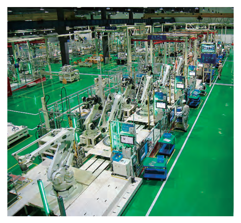
Fig. 9 Main assembly line