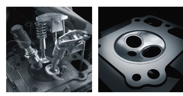
Fig. 3 Kawasaki V-valve Fig. 4 Spherical combustion chamber

We achieved top-class light startability by improving the precision of the auto-decompressor (a mechanism that